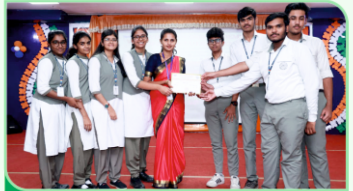
5th Place In Chess Competition