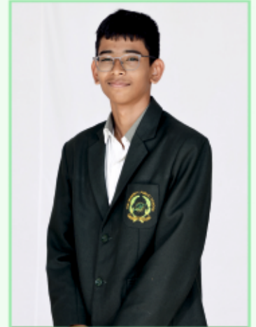
TEJAS L P 98%