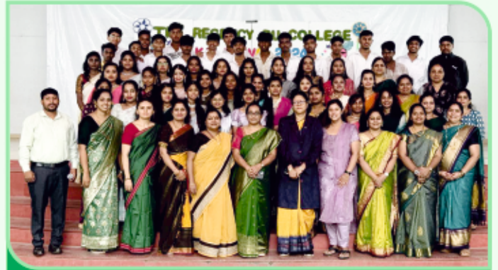
Kalarava Cultural Fest