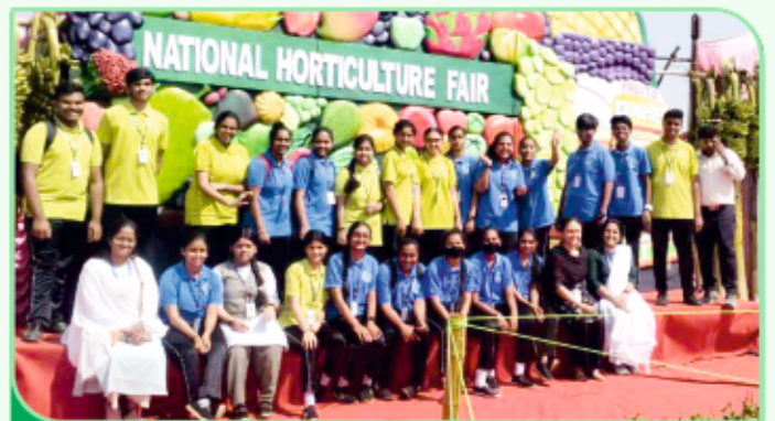
GVK Educational Trip